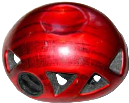
Foam helmet after impact testing

These can be discussed together, because the foam part of hybrids do most of the work. During impact the foam decelerates the striking object by buckling of the individual foam cells. In order to have a compact, nice looking helmet, the designer usually wants to use the thinnest foam possible, which means using a stiff foam. One problem with stiff foam is that with small impacts, the cells don't buckle at all and the transmitted force is much higher than it could be. The stiff foam protects well against large impacts, but not so well against the smaller impacts which tend to lead to concussion. This also makes foam helmets less suitable for caving.