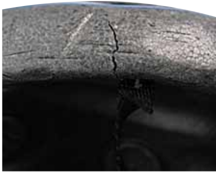
Cracked foam helmet

It's wise to regularly inspect your helmet for any damage: