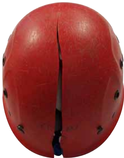
Old plastic shell after impact testing

Lifetime is the maximum period that the manufacturer feels that the product would be able to provide adequate protection over. It assumes a helmet that has been well cared for and hasn't sustained any damage.