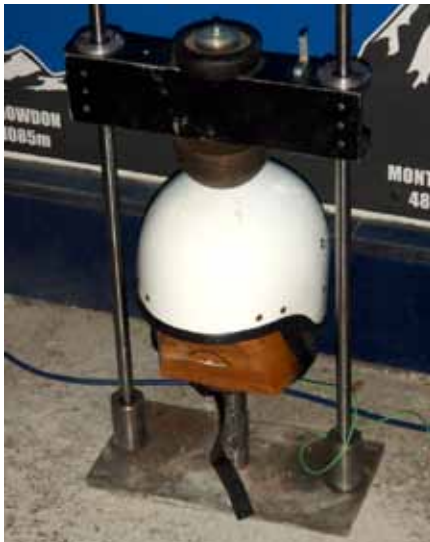
Testing an old Joe Brown hardshell helmet

To be sold within the EU, climbing helmets must have been independently tested and shown to have met or exceeded the requirements of the EN12492 standard. In addition, if the slightly stricter requirements of the UIAA 106 standard are met, then the manufacturer has the option of applying the UIAA Safety Label to the product.