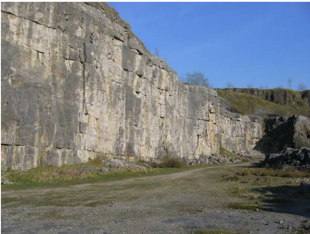
Horseshoe Quarry, Peak District. This quarry is part of a SSSI.

Where the protected species is a bird this may be fairly apparent, but in the case of small plants such as lichens, bryophytes and rare grasses, identifying protected species can require specialist knowledge. All climbers need to bear in mind that the legal onus is on them to find out what is present before equipping a new line.