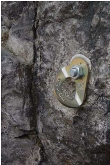
Glue-in threaded bar anchor, with a Fixe hanger.

Threaded bar needs to be treated with a degreaser to get the required bond with the resin. There are complications because of the need to torque the nut on afterwards, when the resin has set, however this can easily be avoided by using a nylock nut which is pre-positioned on the threaded bar. It is very important that the threaded bar is cut with a wedged end to prevent it turning on its threads. Commercially available industrial fixings of this type are available, which remove the issues concerned with using home made equipment.