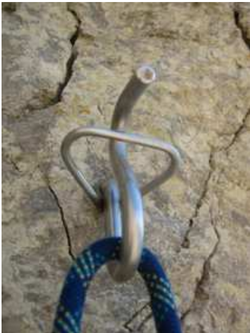
Cracked rock around this lower off could cause problems.

Bolts should, where possible, be installed in rock that is sound and not where there are fissures running behind it. To judge if the rock is sound, gently tap the rock with a hammer and listen for resonance. A dull thud or hollow sound might indicate that the proposed installation site harbours unobvious fractures and is potentially unsafe. The degree of resonance that is acceptable is a matter of judgement and any installation in rock will always be subject to some doubt.