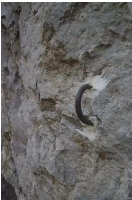
Home made staple anchor.