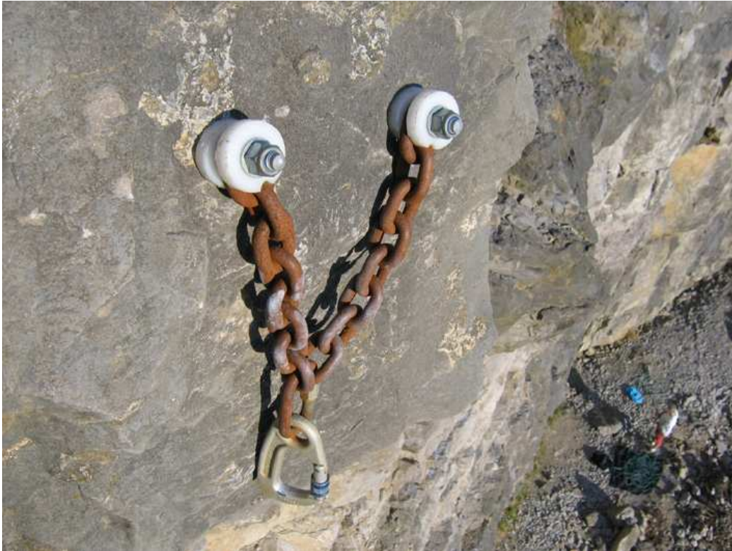
A homemade lower off at Horseshoe Quarry.

Subjecting your product to pull tests to reassure yourself of their capacity to withstand repeated falls as in the proposed revision to the European standard would be a good idea. The BMC may be able to assist with this. Despite these reservations, the overall record of these bolts is very good with very few reported failures, with many of these due to defects which have since been designed out.