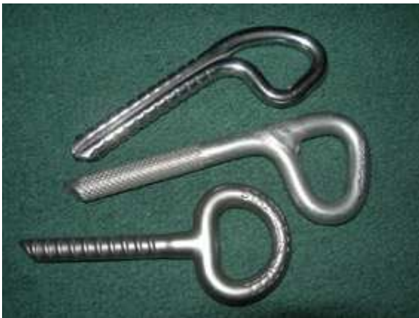
A selection of eyebolt anchor types.