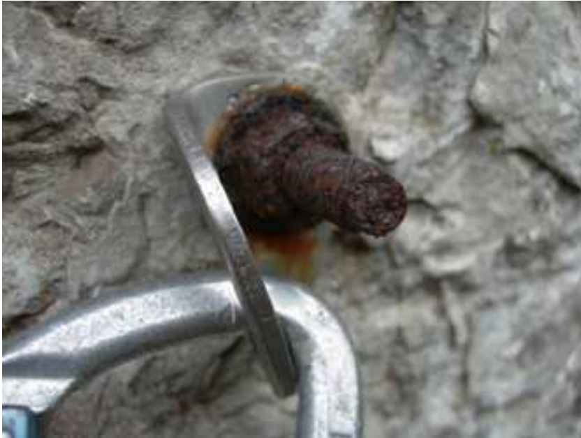
Stainless steel hanger, mild steel bolt

In the example mentioned, the portion of the bolt nearest to the hanger would corrode and the hanger would hardly be affected. Again, the effect of this type of corrosion is easy to see. As seawater is more conductive than freshwater, this type of corrosion is worst in coastal areas.