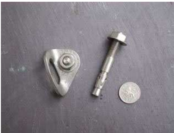
Petzl 10mm through bolt.

A hole is drilled to the required depth and the anchor hammered, complete with attached hanger, washer and nut, into the hole. Tightening the nut draws the tapered end of the bolt into the metal collar causing it to expand. Once the nut has been tightened (never over-tighten it) the unit is ready for use. From a conservation point of view it is good practice to drill the hole deep enough so the bolt can be hammered into the rock when, in future years, it corrodes, as once expanded they cannot be easily extracted. However, never knock the bolt back into the rock and retighten it, as the unit is then likely to be unsafe.