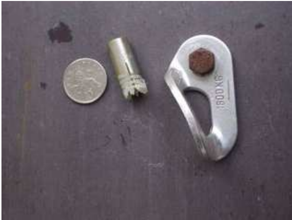
Petzl 8mm self-drilling anchor.

The anchor is placed onto a device called the driver, which enables it to be hammered into the rock. By modern standards these anchors are weak even when placed in hard rock such as granite.