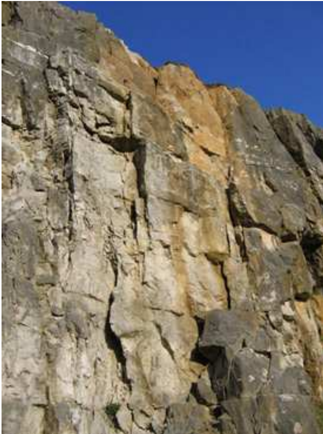
The bolts on this route are good, but how long will the route itself be there for?

Due to the possibility of rock fracture, any placements, even in the soundest rock, should ideally be a minimum of 200mm away from an edge, fracture line or other bolt. In real-life situations, this is often impossible to achieve.