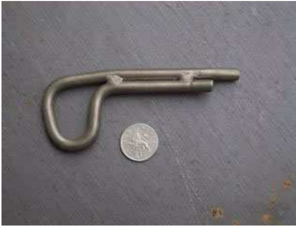
DMM Eco anchor.

The placement is less complex than the Staple and requires a single 18mm hole to the appropriate depth. The hole should then be cleaned as in the case of the staple and the glue applied in the same manner.