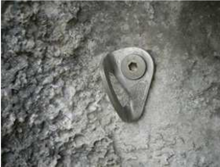
Sleeve anchor with a Petzl hanger.

A hole is drilled to the correct diameter and depth and the bolt tapped into the hole complete with hanger. Expansion of the sleeve is then achieved by turning the nut, which then draws the sleeve over the tapered end of the threaded bolt. This gradually tightens until the nut is locked against the washer and the unit is secure. This type usually requires the hole to be thoroughly clean to enable the tapered end to bite.