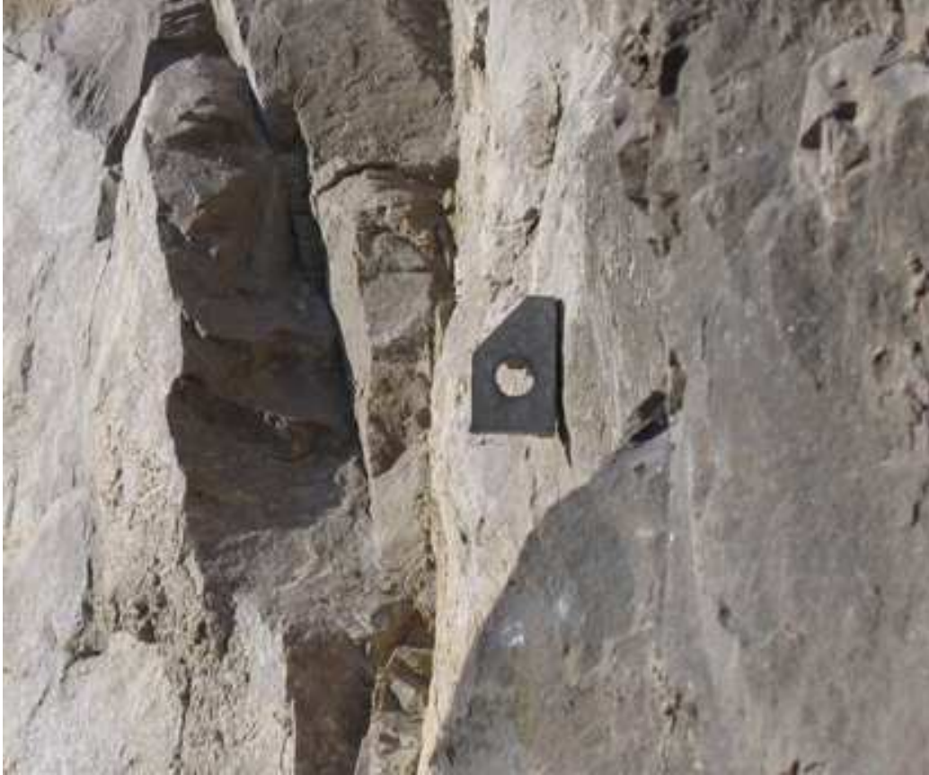
A homemade hanger at Horseshoe Quarry.