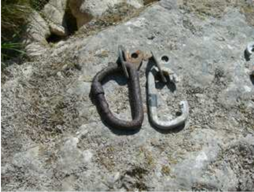
Alloy and steel krabs quickly become useless.

A useful but cheaper option is to place two glue-in bolts 200-300mm apart, one higher than the other to reduce kinking of the rope. The eyes of most common glue-in bolts are big enough to thread a bight of the rope whilst also loaded with a karabiner and quick-draw. The rope should only need to be threaded and untied by the last member of the party and all other descents and or top rope ascents should be made through leader placed quick-draws to avoid excessive wear on the eyes of the bolts.