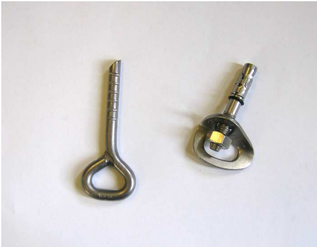
Fixe glue-in and Petzl mechanical bolts, manufactured to the EN 959 standard.