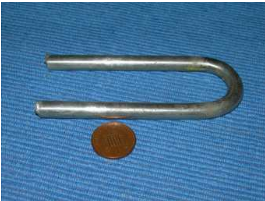
This early version of a staple pulled out at a very low load. Without notching or filing there was nothing for the glue to key onto.

The force required to pull the staple horizontally out is very low if the legs are parallel and smooth since there will be no mechanical key. A common way of reducing the problem is to put a bend (approximately 15 degrees) in the leg. One set of tests showed that a lot of notches needed to be cut to gain a good key (care must be taken to not weaken the leg with too many notches). Roughening the bar by grinding it also improved the hold. Deep (approx 1mm) threads formed a much better key than notching and grinding, shallow (0.3mm) threads were, understandably, much worse. The key variable seems to be the volume of glue that is keying the staple.