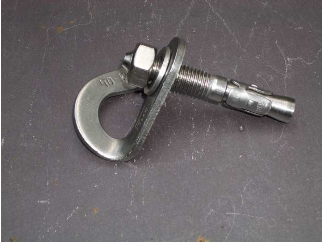
Fixer hanger, mounted on a commercially sourced industrial expansion bolt.

There are industrial fixings available, both mechanical and glue-in, which may be suitable for use in climbing. Because they are not specifically tested for this purpose, the onus is on the installer to correctly specify their requirements when ordering from their supplier. This does incur extra responsibilities on the installer. For instance, some bolts may have the required shear strength, but are not designed for dynamic loading.