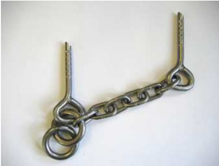
Chain linked lower off with welded ring.

Installing lower-offs and belays depends very much on the quality and local topography of the rock at the desired point. Ideally a belay or lower off should consist of two anchors placed in good quality rock, positioned for ease of attachment rather than as close to the top of the crag as possible. If the rock is at all suspect or seamed with cracks it is sensible to place the two anchors in separate blocks, even if this means they are further apart than the distances suggested below.