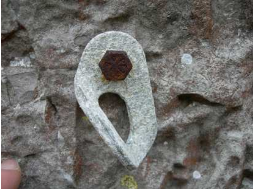
Aluminium hanger, steel bolt.

Unfortunately, the most effective element for strengthening aluminium is copper, which also results in a decrease in corrosion resistance. Corrosion usually takes the form of pitting or exfoliation, which can drastically reduce the strength of the metal. For this reason, aluminium alloys are not recommended for hangers.