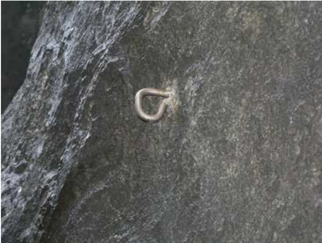
Eco anchor placed in a drainage line

It is a pity that nothing lasts forever. This is as true of metals as it is of other substances. Before purchasing/making any bolts you may find the following information gives you an indication of how long they may last in different environments and what may be best to buy.