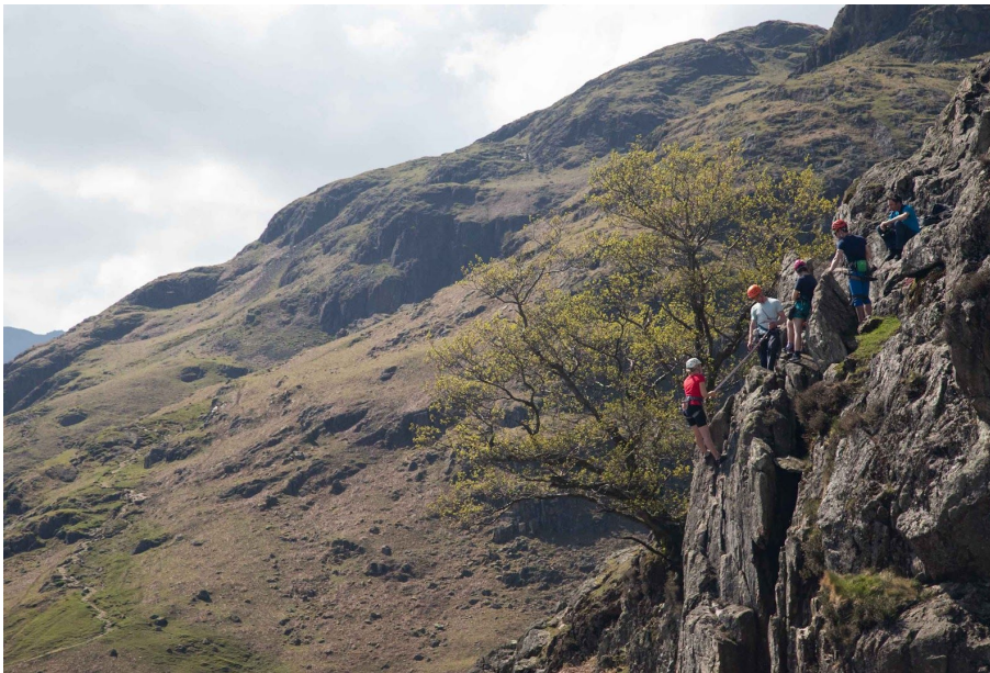
TWO IMAGES FROM BIG MOUNTAIN WEEKEND OR ARC'TERYX AND LAKELAND REVIVAL