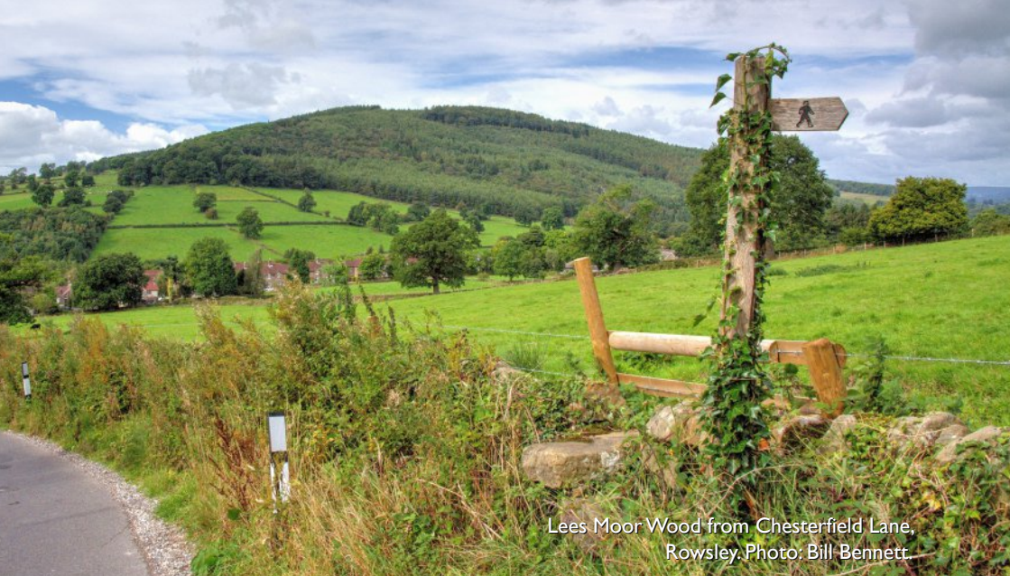
Lees Moor Wood from Chesterfield Lane, Rowsley.

have to resign. I have thought long and hard about how to word the following sentences, whether to remain impartial or express my own opinion, but my feelings surrounding the matter are resolute: it is both non-constructive and damaging to the organisation.