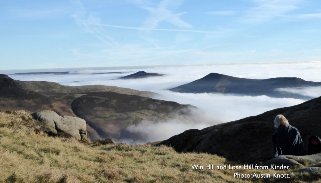
Win Hill and Lose Hill from Kinder.