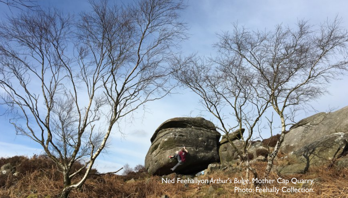
Ned Feehally on Arthur's Bulge, Mother Cap Quarry.