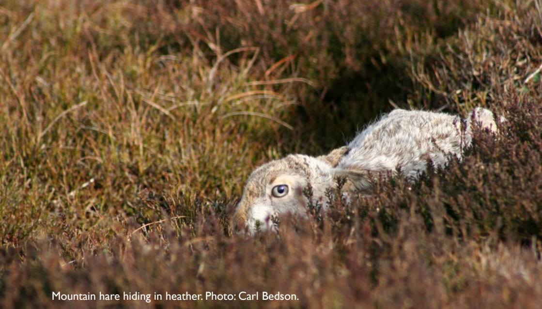
Mountain hare hiding in heather.