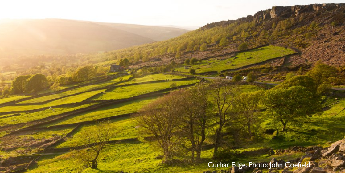
Curbar Edge.