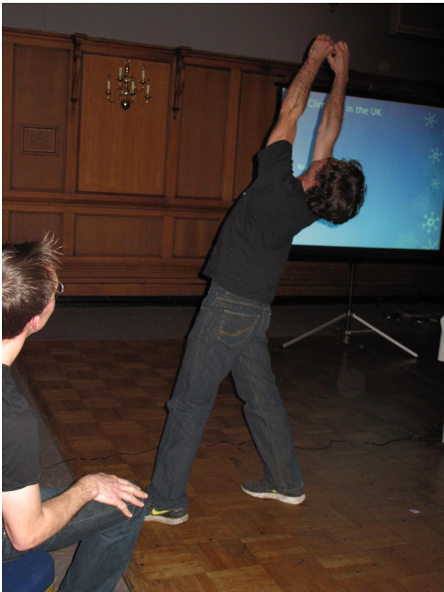
Peak Area AGM meeting. Don't ask...