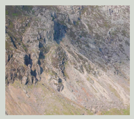
erosion below Dinas Cromlech

impact survey on the impact of climbing.