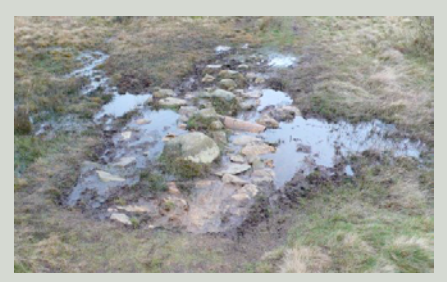
motorbike damage in the Moelwynion

There was an inaugural meeting of the North Wales Alliance to Manage Off Roading in Blanaeu Festiniog on 5th July.