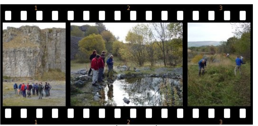
Volunteers working out

If you find your quiet enjoyment is upset by off road motor propelled vehicles you will be pleased to know Operation Blackbrook, mounted by the Police, the County Council and the National Park Authority is having a positive effect. A lot of pressure was put on the County Council at the last Blackbrook meeting, and also by the Local Access Forum, to expedite matters of determining the status of routes, and of repairing the surface where this is badly eroded. The major problem is that it is all demanding on a financial and personnel resource which is in very short supply. The County Council (ie the Highways Authority) will point out that in devoting their budget primarily to black tops the accident rate in the County has been reduced, and ask 'what would your priority be'? The next Blackbrook meeting is on 12 January 2010 at 19:00 in Bakewell Town Hall. It is open to anyone who wants to attend.